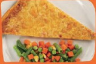
Bubble salmon and crinkle cut wedges