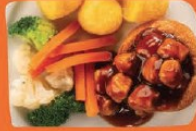
Sliced chicken and Yorkshire pudding

CHOOSE FROM Quorn pieces in a Yorkshire pudding V