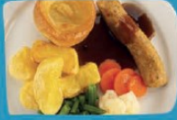
Sliced beef and Yorkshire pudding

CHOOSE FROM Plant-based sausage and Yorkshire pudding V