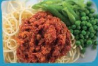
Chicken Katsu curry and rice