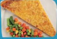
Sweet sticky chicken with rice