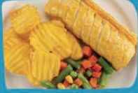
Ham carbonara with pasta

CHOOSE FROM Vegetarian sausage roll with crinkle cut wedges V