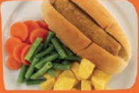
Chicken curry and rice

CHOOSE FROM Plant-based sausage hotdog and diced potatoes Vg