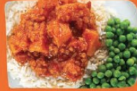
Fish fingers and chips

CHOOSE FROM Sweet potato and lentil curry and rice